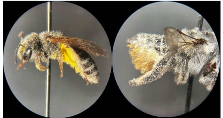
Microscope views of Halictus ligatus (left) and Megachile petulans (right) showing the large amount of pollen bees can collect in their "hairs"; Photo credit: Katie Cody, Office of Kentucky Nature Preserves

Native bees have evolved to be extremely effective pollinators. Bees are the only pollinators that will actively gather pollen and move it across the landscape (with a few exceptions in the wasp world). Other pollinator groups, such as beetles, flies, wasps, butterflies, and moths, will visit flowers to drink nectar or consume pollen, but don't intentionally move pollen around.