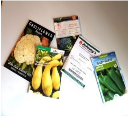
Figure 1: Seeds can be purchased from a variety of sources. Note that inclusion in this image does not indicate endorsement of any brand.

Spring may feel far away, but vegetable garden planning begins during the cold months of winter. Seed catalogs, store displays, and online retailers present a number of different options (Figure 1). However, successful production begins with the selection of the right seeds for each garden. Gardeners often have preferences towards certain cultivars or varieties, but if plant diseases have plagued plants in the past then it may be time to consider a change.